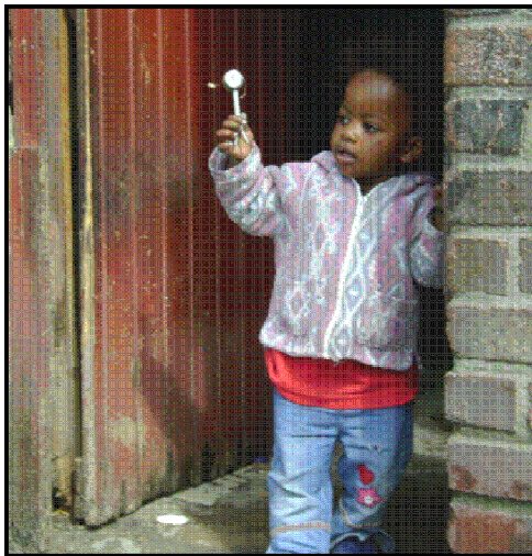
A child in Imazamo Yethu enjoying a moment of "wonder and awe."

In the Gospel reading for Christmas Day we hear that "the Word became flesh and made his dwelling among us"