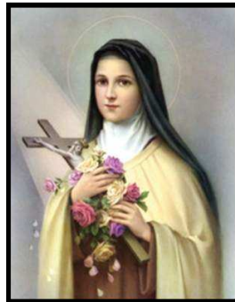
The “Little Flower” St. Thérèse of Lisieux