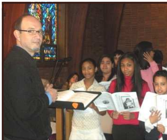
Several members of the St. Simon Stock School Children's Choir sang during the Liturgy